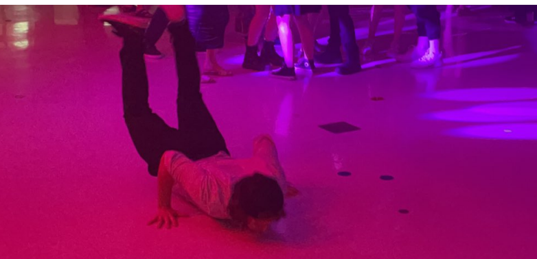
Students had an incredible time at the semiformal dance! Thank you to DJ Todd for the music, lights & photo booth!